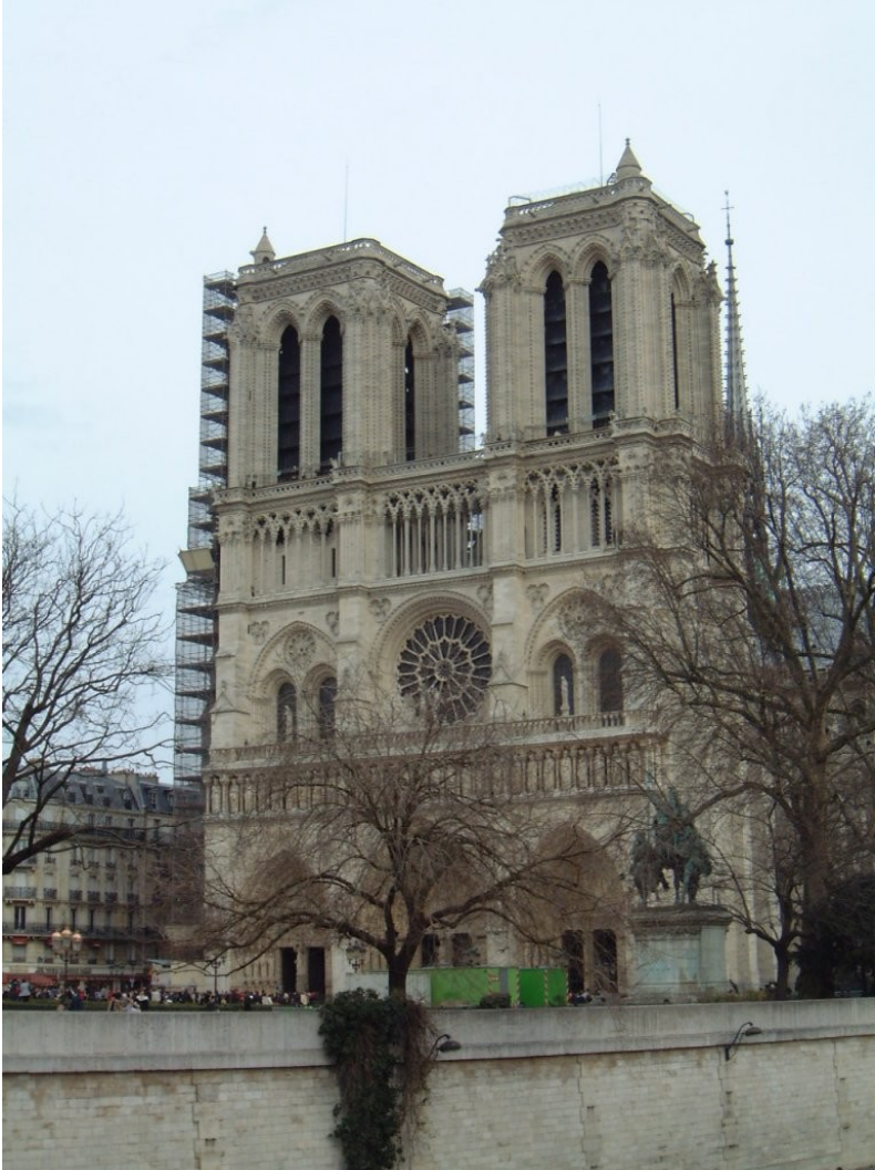
NOTRE DAME CATHEDRAL in PARIS