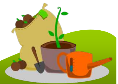
A glimpse of the thriving vegetable beds!